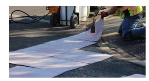
Step 2: Position