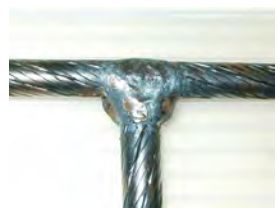
The templates are constructed of 3/8" swages wire rope pieces welded together to create a pattern

StreetPrint designs can range from traditional brick patterns to custom motifs and logos. Their installation and manufacturing processes can place some limitations not only on what can or cannot be done, but what looks aesthetically pleasing as well. Manufacturing and installation considerations should be taken into account when thinking about using custom StreetPrint templates