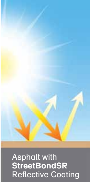
Asphalt with StreetBondSR Reflective Coating