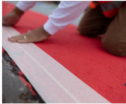
Figure 2: Typical Masking