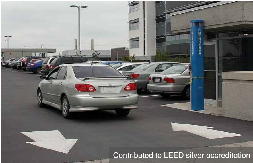
Contributed to LEED silver accreditation

Pavement surfaces comprise roughly 30%-40% of the urban footprint and are a leading cause of Urban Heat Island Effect.