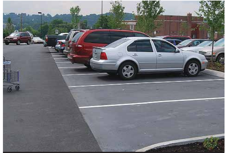
Augusta, ME: First Grocery Store to Obtain LEED Platinum

StreetBondSR (in slate color) was used at Research in Motion's 59,000 sq. ft. parking lot area. The use of StreetBondSR led to LEED credits that contributed to overall LEED certification of the building.