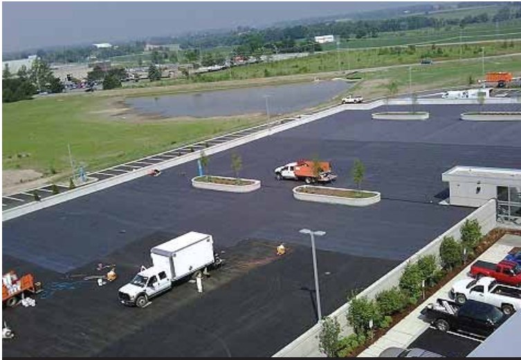
Waterloo, ON: Image of Project Installation at Research In Motion's Main Office Area